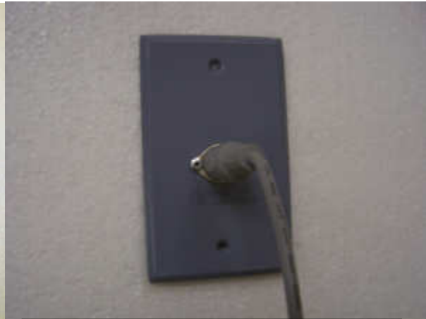
Cable – Junction Box Receptacle

NOTE: When POWER is turned ON to the scoreboard, it will momentarily display the code for the sport the scoreboard is ready to display in the HOME TEAM SCORE Section's far right digit, or, the one's position. This code only shows for about three seconds and then changes to the default 0 (zero) score. The code for baseball is "5". In the event the scoreboard does not display a "5" at start-up, follow the directions for changing GAME MODES in the instructions below.