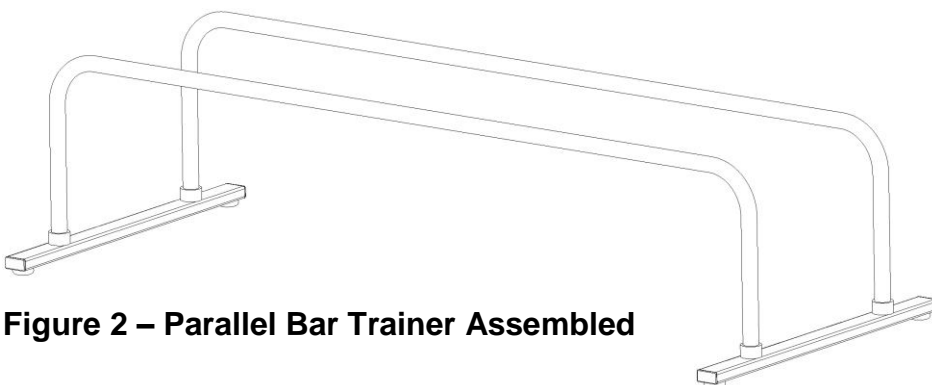
Figure 2 – Parallel Bar Trainer Assembled