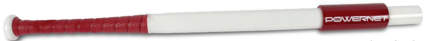
Sweet Spot Bat