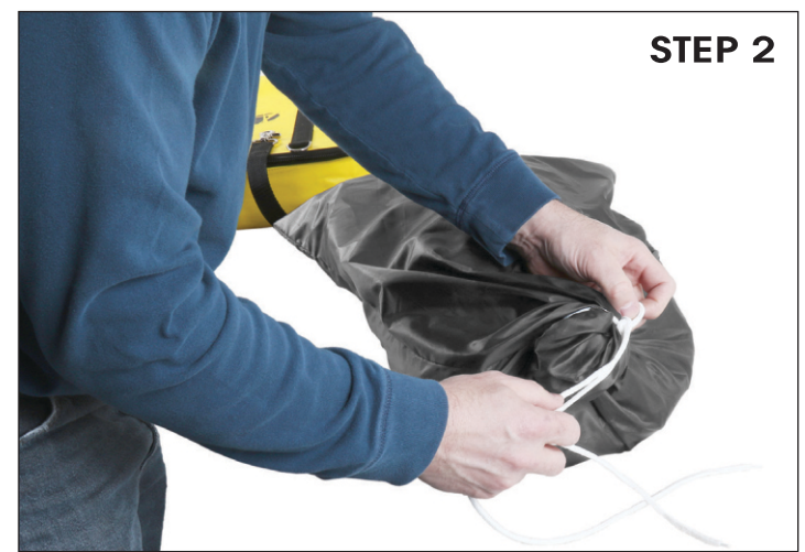
Pull drawstring tight and tie closed