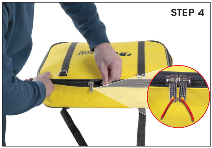
Zip closed and use cable tie to secure