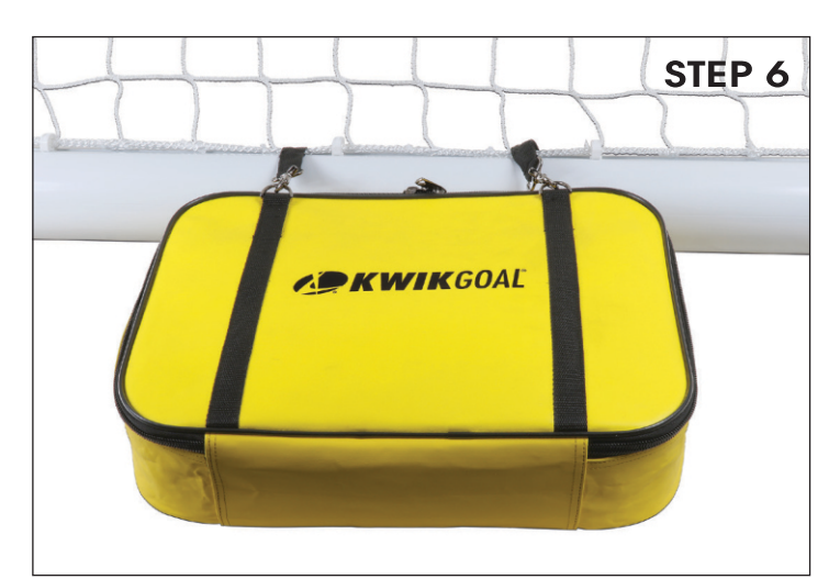
Refer to Anchor Weight Requirements for proper amount of anchor bags needed to anchor specific goal model