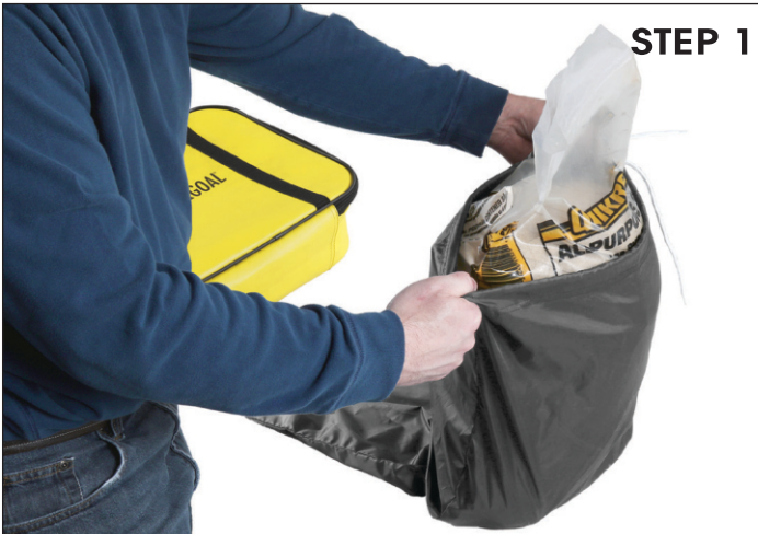
Place 50 lbs. bag of sand into bladder