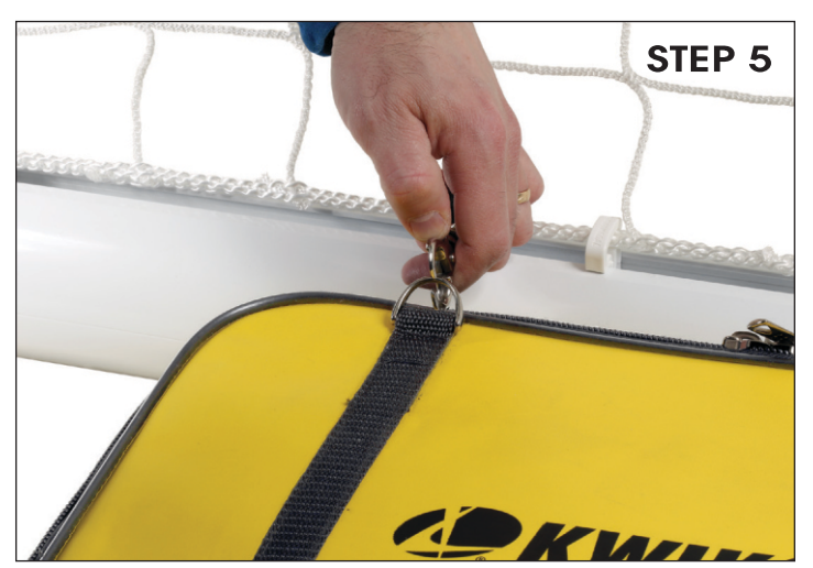
Wrap both anchor bag straps around back bottom crossbar locations as shown on goal instructions