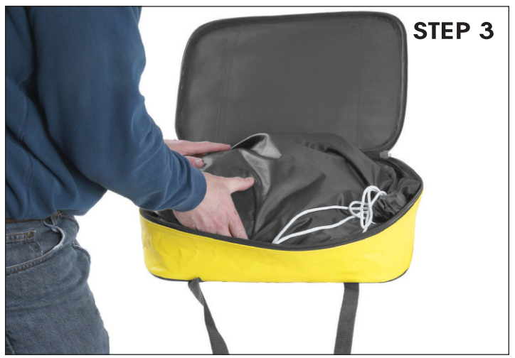
Drop bladder with sand bag into anchor bag