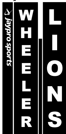
Side 1 Side 2