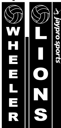
Side 1 Side 2