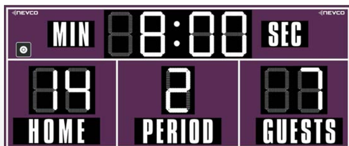
SHOWN WITH OPTIONAL WHITE LEDS