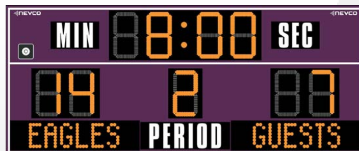
SHOWN WITH OPTIONAL ELECTRONIC TEAM NAMES