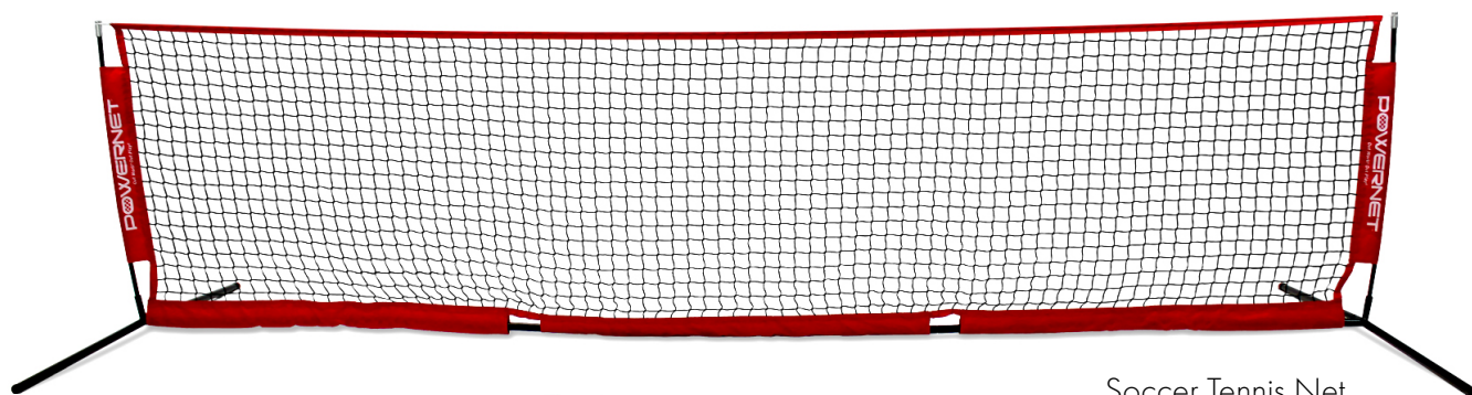
Soccer Tennis Net