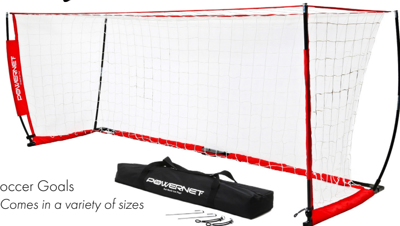
Soccer Goals *Comes in a variety of sizes