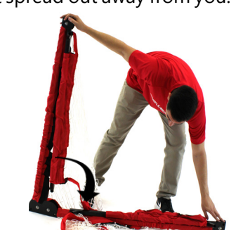
<mark>1b. Then set one leg down</mark> on the ground.

1a. Unwrap the net and place the 1c. Slowly telescope the legs up on double hinge on the ground with one side of the frame until it locks.