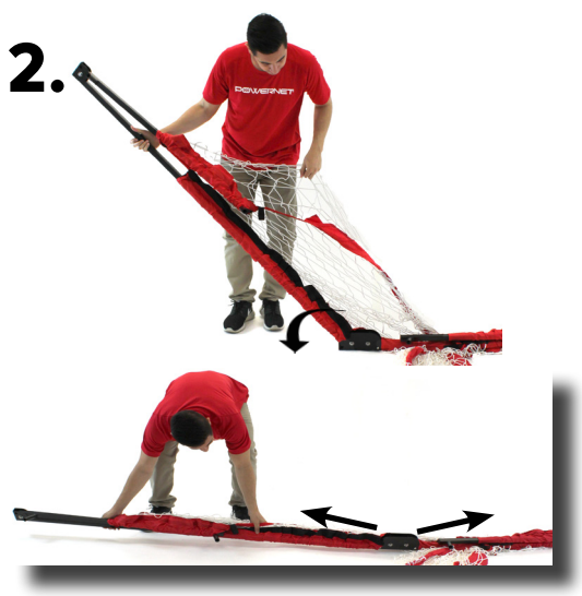
2. Open up middle hinge bracket of the base frame until it locks on both sides.

NOTE: Per step 1 the center is designed to be raised & curved off the ground. Don't force the middle down!