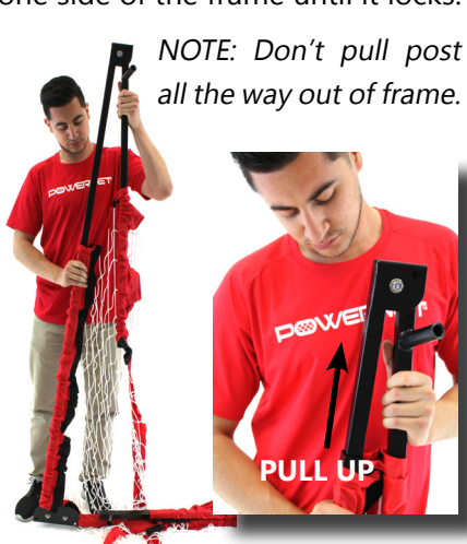
1d. Repeat steps 1a-1c on opposite side.

1a. Unwrap the net and place the 1c. Slowly telescope the legs up on double hinge on the ground with one side of the frame until it locks.