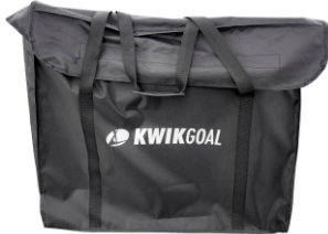
Goalazo Goal Carry Bag (1)