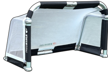
Goalazo Goal (1)