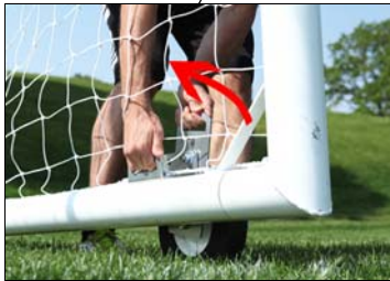
No. 293000 NEVER FLAT FLIP WHEELS 4 WHEELS INCLUDED PER GOAL

GOAL CAN NEST UNDER 8' OFFSET FOOTBALL GOAL POST