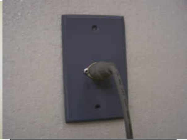
Cable – Junction Box Receptacle

NOTE: When POWER is turned ON to the scoreboard, it will momentarily display the code for the sport the scoreboard is ready to display in the HOME TEAM SCORE Section's far right digit, or, the one's position. This code only shows for about three seconds and then changes to the default 0 (zero) score. The code for baseball is "5". In the event the scoreboard does not display a "5" at start-up, follow the directions for changing GAME MODES in the instructions below.