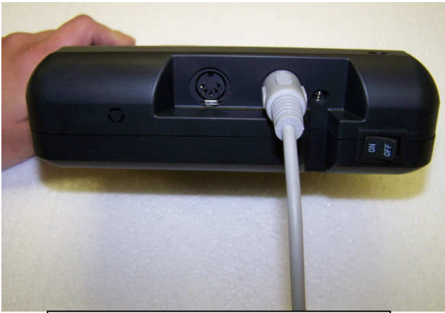
Cable – Back of Controller